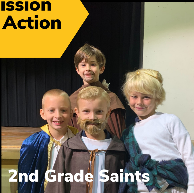
2nd Grade Saints