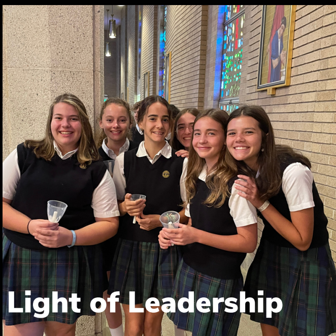
Light of Leadership