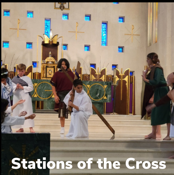
Stations of the Cross