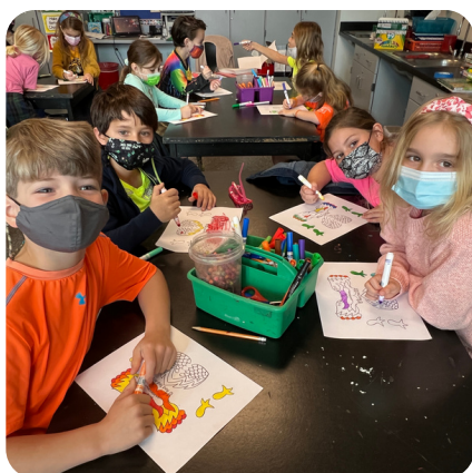
Catholic Schools Week