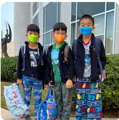
Catholic Schools Week